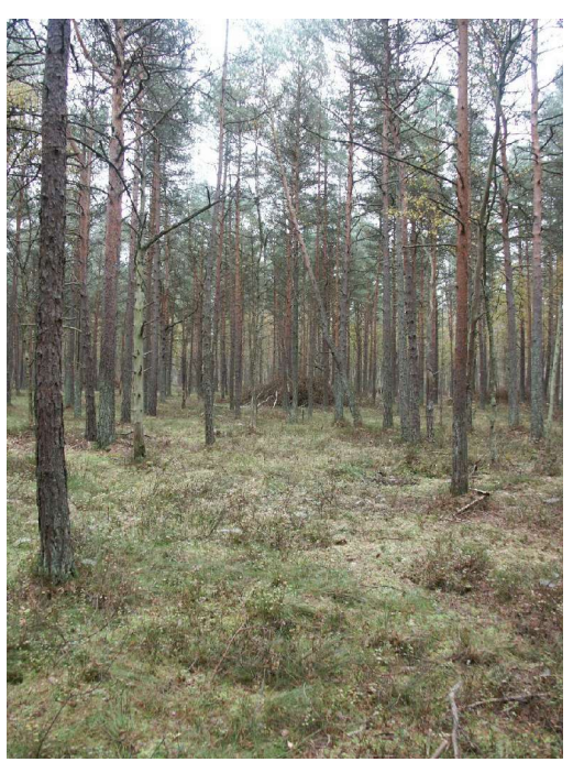
Fig. Bog forest (habitat 91D0) after removing the birch understory Ciemino Bog (site 18)

As a result of executing part of this action by voluntary work, not by subcontracting, some little modification in costs categories appears (costs of volunteers accommodation, feeding, insurance and costs of materials in place of subcontracting costs).